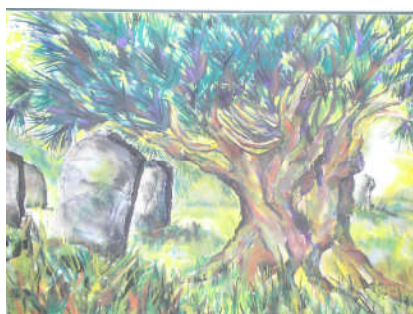
'Tree in churchyard', mixed media by Angela Fletcher

Pocklington Arts Centre 3 rd – 28 th July