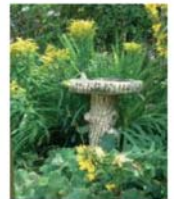
Weekly classes held in Burnby Hall Pocklington

Workshops for absolute beginners available too!